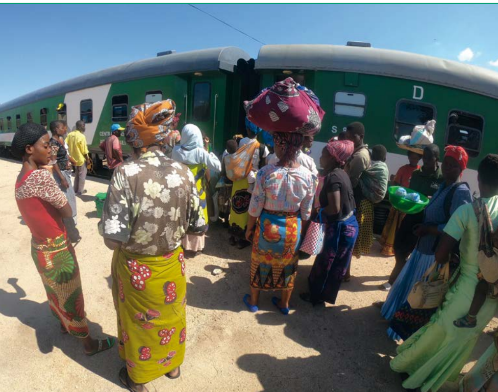
■ Fig. 2: Railway station on the railway line in the Nacala Logistics Corridor (NLC).