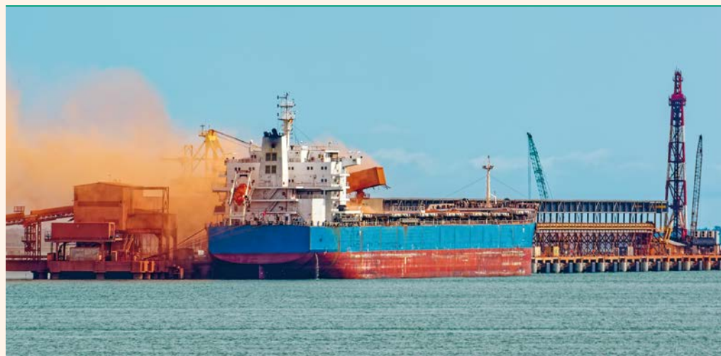
■ Fig. 2: A cargo ship in the port of Kamsar is loaded with bauxite, aluminium, and iron ore (sst).