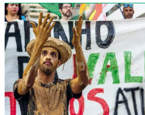
■ Fig. 5: Protest in Brazil against the breach of the tailings dam in Brumadinho in January 2019