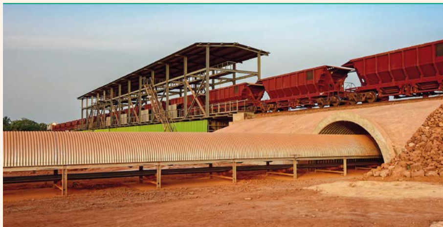
■ Fig. 1: Bauxite is loaded onto railway wagons and transported to the port of Kamsar in Guinea. Most of the bauxite is exported to China (sst).